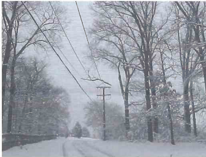
Snow adds weight to the overhead wires during a snowstorm.

To counter this, BGE is instituting a "right tree, right place" program for our area in Spring, 2005. BGE continues to