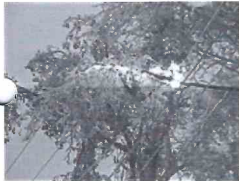
Burning wires are another issue that BGE addresses.

make efforts to proactively and responsibly trim trees overhanging its wires. If you have questions about tree trimming in your neighborhood, call BGE. RRLRAIA maintains a list of recommended trees and shrubs at the office, or call 410-685-0123 and ask for the Forestry Management Unit, or go to www.bge.com