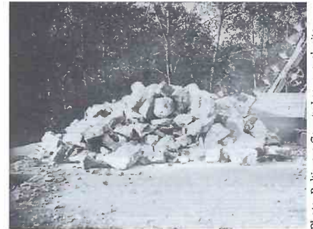
Rocks from the Bare Hills Chrome Mine and Serpentine Quarries, circa 1927.