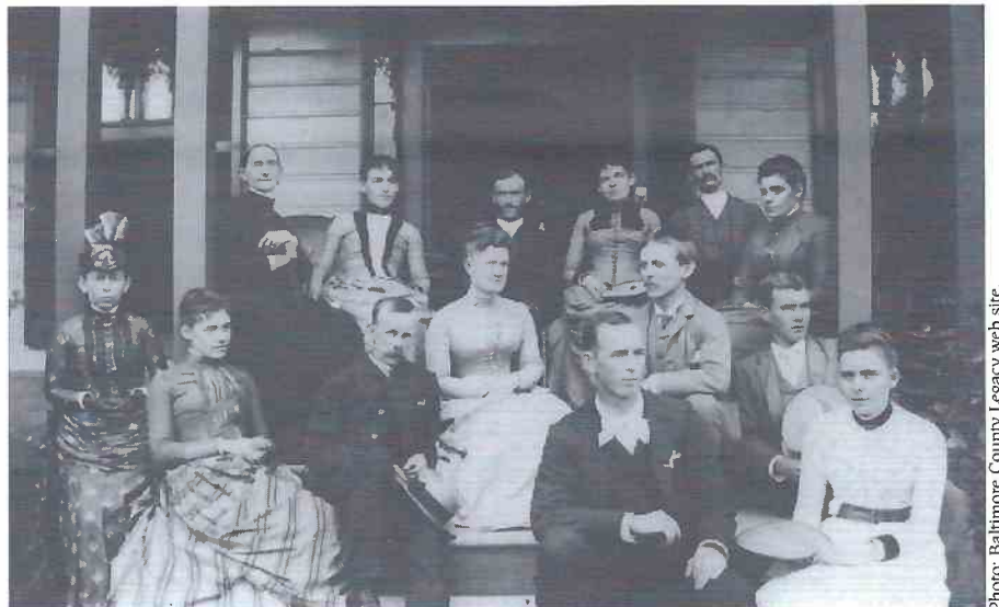
The Literacy Club of Ruxton.

Trustees of the Foundation recently accepted a number of significant preservation easements on area properties. Preserving this land ensures that open space goals, as articulated in the Community Plan adopted by the County Council in 2001, are kept on course. The Foundation's Annual Report, published in January, will contain information on the easement program. To learn more about the benefits of donating easements on your property to the Foundation, contact the Association at 410/494-7757 or email ruxrider@bcpl.net .